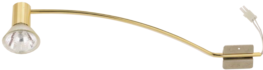
Cornice Light , with fixed head Rod Ø 6 mm ( \frac{1}{8} "") Finish: steel

Length: 330 mm (13") Height: 95 mm (3 \frac{7}{8} ")